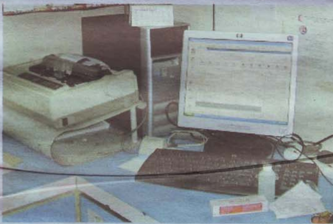
ClinicPlus runs on MSSQL database to ensure reliability and cost-effectiveness.

The sight of files arranged in cabinets next to rows of medicine bottles in a clinic administration area may soon be a thing of the past. Software company TRM NETT Systems (M) Sdn Bhd has come out with a software solution to allow clinics to go paperless. IZWAN ISMAIL writes.